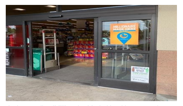
A sign reading 'Millionaire Made Here' hangs on the entrance to Vons in Fresno; picture taken Saturday, July 30, 2022