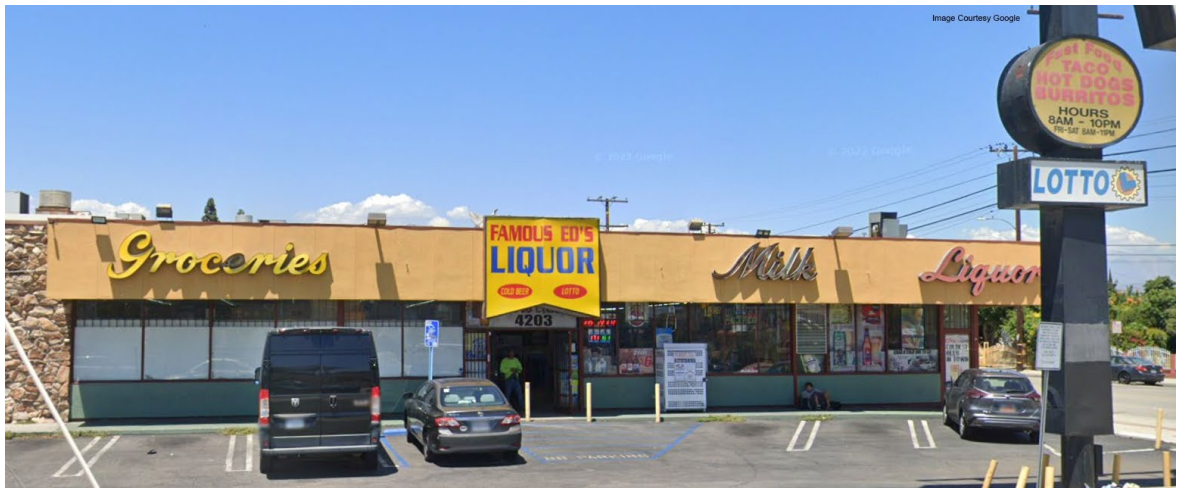
(Image of a 100X Scratchers ticket and Famous Ed’s Liquor in El Monte)