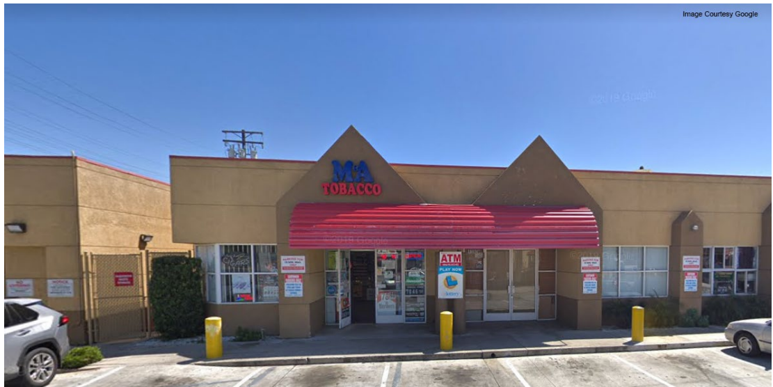
(Image of a 2023 Scratchers ticket and M & A Tobacco in Santa Monica)